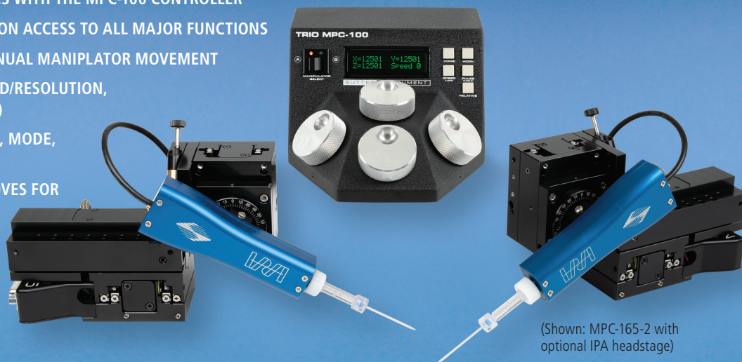
(Shown: MPC-165-2 with optional IPA headstage)