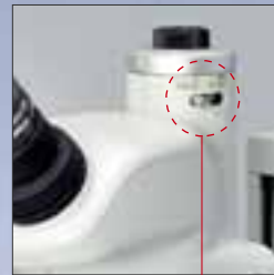
Optical path switching lever

The SMZ745T incorporates an optical path switching lever that enables easy switchover between eyepiece and camera. Nikon Digital Sight series camera can be attached.