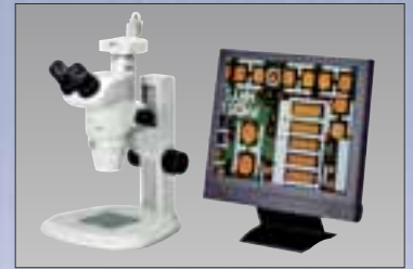
With Digital Sight series camera for microscopes