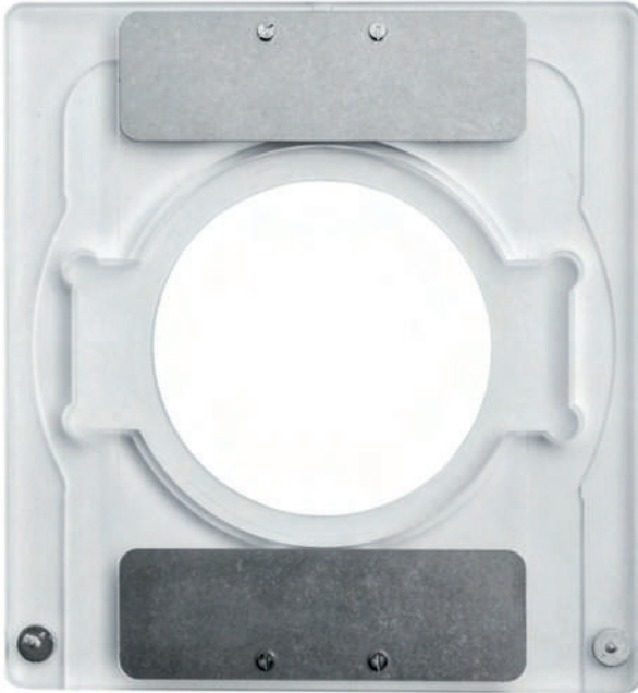
Universal bath chamber

The universal bath chamber allows the use of object holders (26x76), NUNC dishes, Falcon dishes (up to \varnothing 60\text{mm} ) and the LN bath chamber inserts. Additionally the chamber can be used with the LN bridge 500, the LN bath chamber manipulator system and the original microscope tables of the microscope suppliers. The design of the chamber allows the direct attachment of the reference electrode and in/outflow using magnets on the steel surfaces.