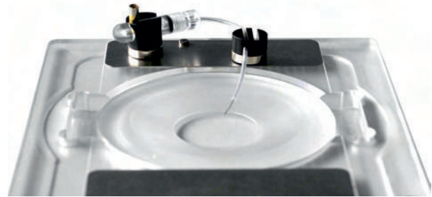
Standard insert Plexiglas insert